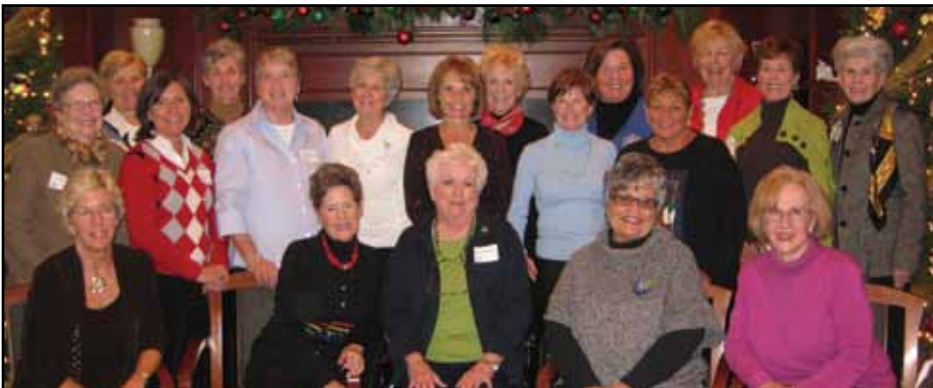
Book Club Members Celebrating at their Annual Christmas Luncheon

Enjoy an evening of Trivia on Wednesday, January 13. Starting at 6:00 pm you may order a light dinner from our luncheon menu. The first set of Trivia questions will begin promptly at 6:30 pm. A professional MC will explain all the rules and regulations and will host the evening's questions. The more people who play the game, the more fun we will have. Prizes will be awarded to the winning team. So gather your team or we will be happy to find a team for you. A cash bar is available all evening with beer and wine specials, plus complimentary dry snacks. We need to know how many will be attending, so please call 277-8015 for reservations.